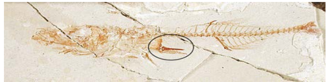
Fossil stickleback with a full pelvis, which includes pelvic spines.

The data below were collected from five different rock layers (labeled A to E) in the desert deposit. Each graph shows the number of fish belonging to each category. Place the rock layers in the most reasonable order from oldest to most recent. Justify your answer in two or three sentences.