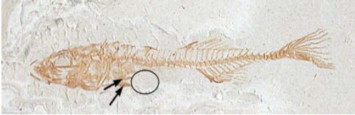
Fossil stickleback without pelvic spines. (The circle shows the region where you would expect to see the pelvis and pelvic spines; the arrows point to the ectoacoracoid bone, which is not part of the pelvis.)